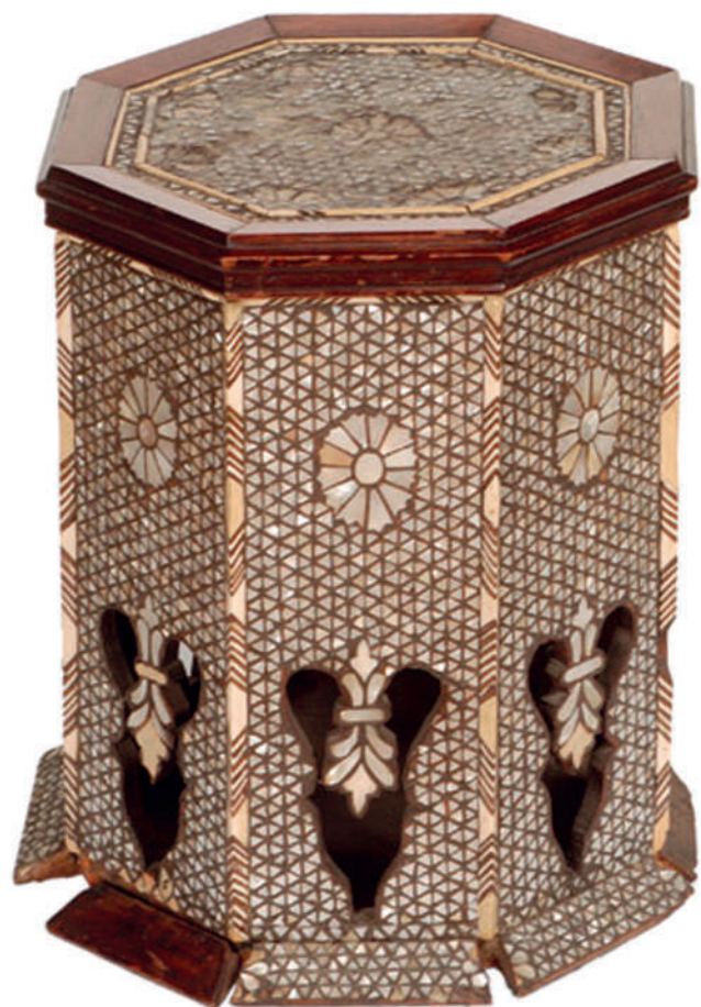
Octagonal small table or tahule Spain, 16 th century Inlaid wood, mother of pearl and ivory.

The tour begins in the Central Patio and from there you can access the different rooms: the Blue Room, the Oratory, the Red Room, the Desk, the Dining Room, the Library and what were formerly the private rooms, now used for temporary exhibitions. The collection of Spanish art assembled by the writer was located in these spaces, formed mostly during the years he lived in France. Over the years, the original heritage was increased through acquisitions, donations and works from other museums, adding valuable works that were perfectly integrated with the initial collection.