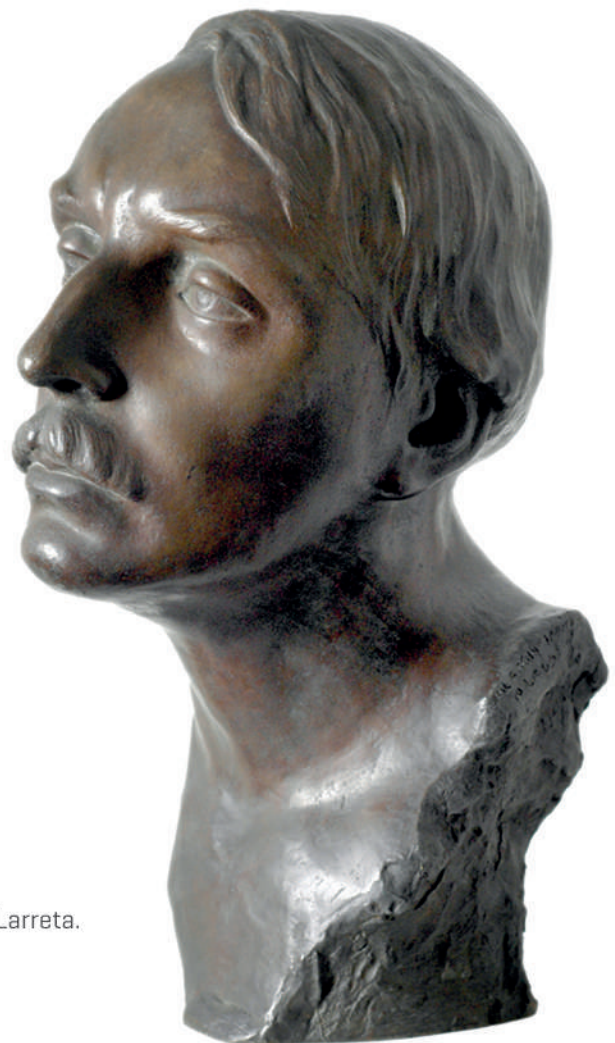
Alberto Lagos , Bust of Enrique Larreta. Buenos Aires. 1917 Bronze

In the room where Enrique Larreta's desk was located, it is the place where the author of La Gloria de Don Ramiro used to carry out a large part of his literary work between 1918 and 1961. One of the most important works in this room is the Reliquary altarpiece with Solomonic columns, made of carved and gilded wood in the 17 th century. During his life, Larreta located it behind the desk and its shelves were used to place books and small art objects.