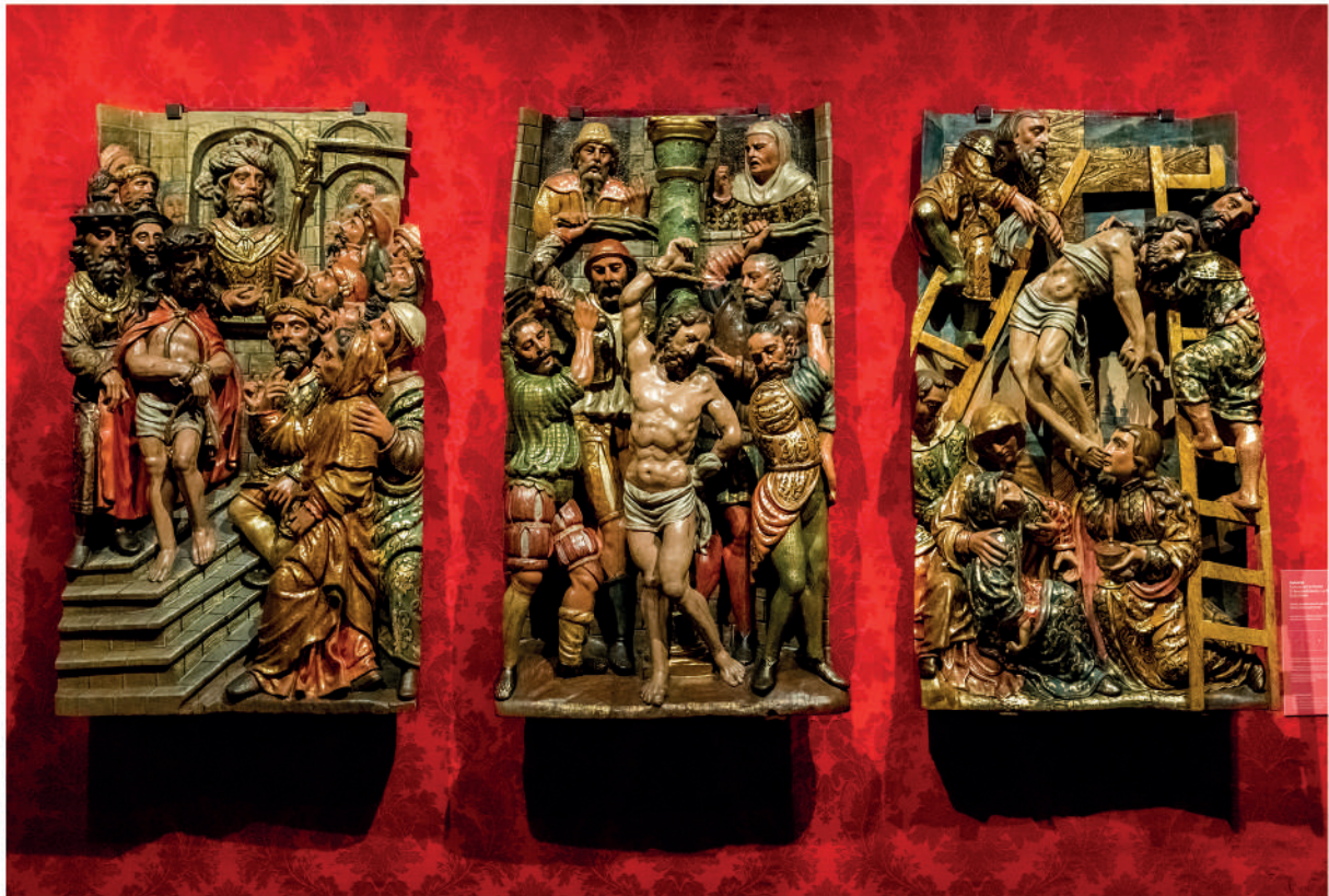
Unknown Artist , Scenes of the Pasion of Christ | Ecce Homo. Flagellation. Descent Spain, second half 16 th century. Polychrome and gilded wood

The works in the Red Room belong to the Renaissance and Baroque and are a good example of the themes that were most widely disseminated during the 16 th and 17 th centuries, at which time Spain became a defender of Catholicism against Islam and the Protestant Reformation. From the Council of Trent [1545-1563] the art of the Counter-Reformation elaborated a religious propaganda plan through moving or exhorting images; the Church as the main client, knows its effectiveness in reaching the illiterate population. Another example of the pedagogical nature of the images can be seen in the space where the Altarpiece of the Childhood of Christ is located. Generally placed on the main altar of the church, the purpose of the altarpieces was to recount facts and miracles from the lives of the saints or narrate religious themes.